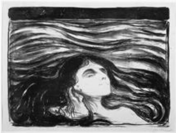
Edvard Munch (1863-1944), On the Waves of Love, 1896. Lithograph, 12¼x 16½ inches. Epstein Family Collection, EFC 073.0.