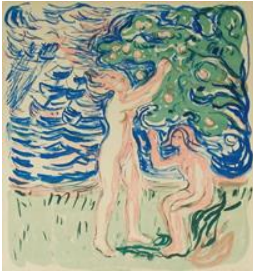
Edvard Munch (1863-1944), Neutralia (Girls Picking Apples), 1915. Color lithograph, 22½ x 20 13 / 16 inches. Memorial Art Gallery of the University of Rochester: Marion Stratton Gould Fund, 72.12.