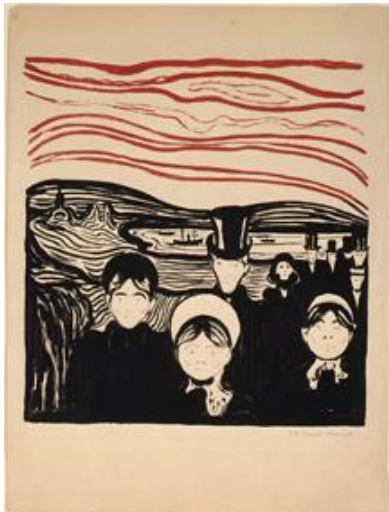
Edvard Munch (1863-1944), Angst, 1896. Color lithograph, 16½ × 15⅝ inches. Epstein Family Collection, EFC 061.0.