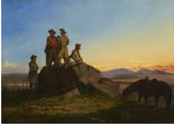
John Mix Stanley (American, 1814 - 1872) , Scouts along the Teton River , circa 1855. Oil on canvas, 24 x 34¼ inches. Gilcrease Museum, Tulsa, Oklahoma (0126.1143).