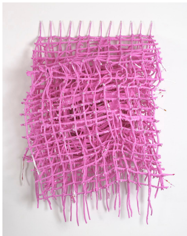
Margie Livingston. Wacked Grid , 2017. Acrylic paint and string, 59 x 42 x 17 in. (149.9 x 106.7 x 43.2 cm). Tacoma Art Museum. Gift of Greg Kucera.