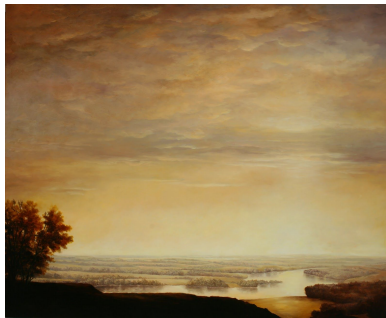
Victoria Adams. Morning Shimmer , 2003. Oil and wax on linen, 57 ¼ x 70 in. (145.4 x 177.8 cm). Tacoma Art Museum. Gift of the artist in honor of Janeanne A. Upp, courtesy of Winston Wächter Fine Art, Seattle and New York.

All image files are available via Dropbox . When using an image of artwork, please include the appropriate credit line as noted below.