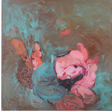
Donnabelle Casis. Untitled , 1999. Oil on canvas, 24 x 24 in. (61 x 61 cm). Tacoma Art Museum. Gift of Ben and Aileen Krohn.