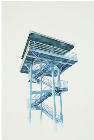
Thuy-Van Vu. Westport Observation Tower , 2015. Watercolor on paper, 22 ½ x 15 in. (57.2 x 38.1 cm). Tacoma Art Museum. Museum purchase with funds provided by Clinton T. Willour in honor of G. Gibson Gallery.