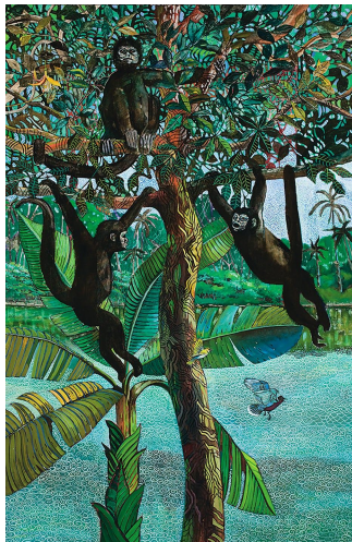
Alfredo Arreguín. Rio Balsas , 1977. Oil on canvas, 70 x 46 in. (177.8 x 116.8 cm). Tacoma Art Museum. Gift of the Bellevue Art Museum.