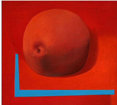
Louis Bunce. Apple , 1968. Oil on canvas, 41 × 48 in. (104.1 × 121.9 cm). Tacoma Art Museum. Gift of Herb and Lucy Pruzan.

All image files are available via Dropbox . When using an image of artwork, please include the appropriate credit line as noted below.