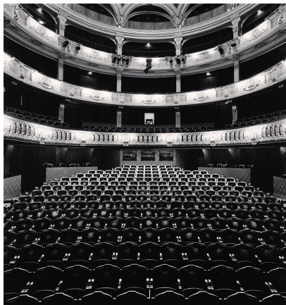
Michael Kenna. Odeon Theatre, Study 1, Paris, France , 2011. Sepia-toned gelatin silver print, 7 3/4 × 7 3/4 in. (19.7 × 19.7 cm). Tacoma Art Museum. Gift of the artist.