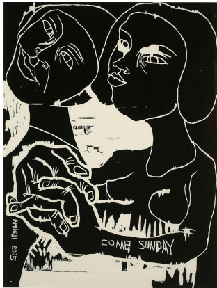
Aminah Robinson. Come Sunday , 2005. Woodblock print, 48 x 36 in. (21.9 x 9.4 cm). Tacoma Art Museum. Gift of the artist.