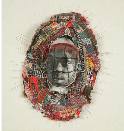
Marita Dingus. Baby Face , 2005. Mixed media, 13 1/2 × 11 1/4 × 1/2 in. (34.3 × 28.6 × 1.3 cm). Tacoma Art Museum. Gift of Flora Book.